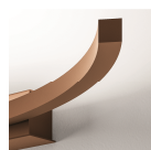
RU Rust brown