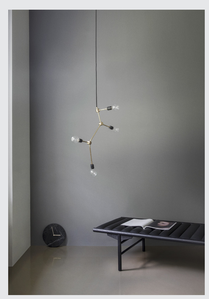
Franklin 4-lite chandelier, ∅:56cm, H:56cm, solid brass or black powder coated steel, uses 4 x E27 bulbs.