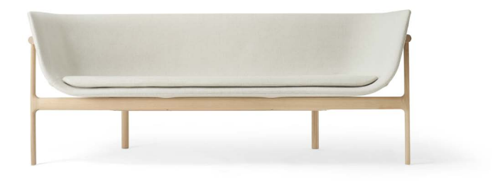
Light Grey 9900030