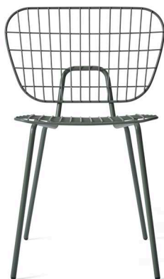
Dusty Green 9520469