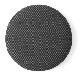
Black/Black Melange Kvadrat, Basel 183