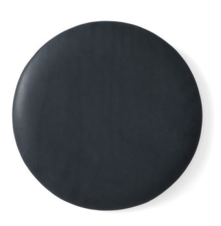
Black/Black Sørensen Leather, Black 21003