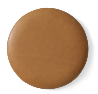
Black/Cognac Sørensen Leather, Cognac 21002