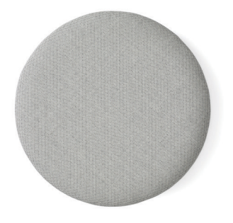
White/White Melange Kvadrat, Basel 123