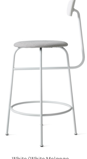
White/White Melange 9420630