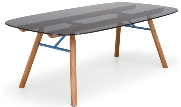
Table with wooden four legs base. Supports in lacquered steel, rectangular top with rounded corners in glass or crystalceramic.